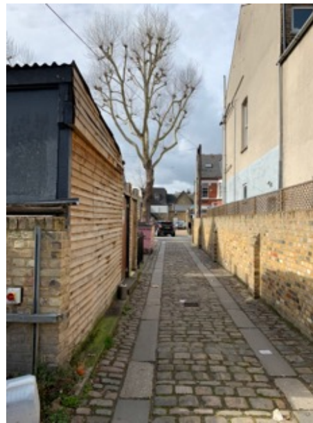
Rear Access & Parking